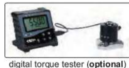
digital torque tester (optional)